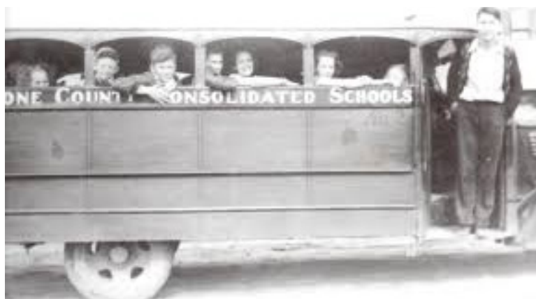
School Bus Transporting Students in 1940