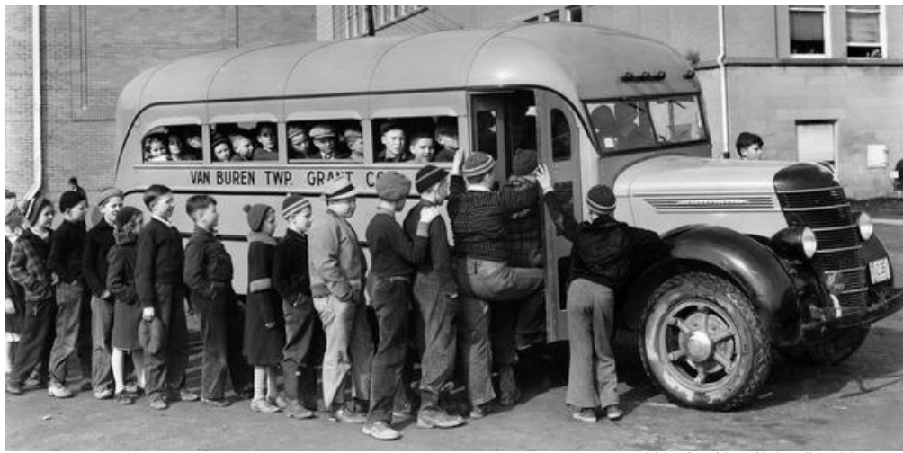
Old school bus